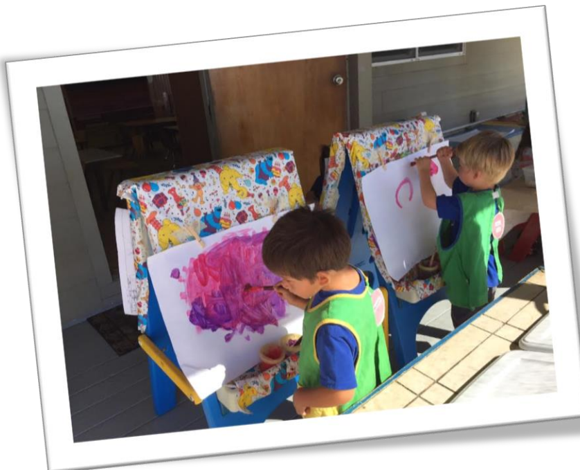
Students at Kauaʻi Independent Daycare Service in Kapaa